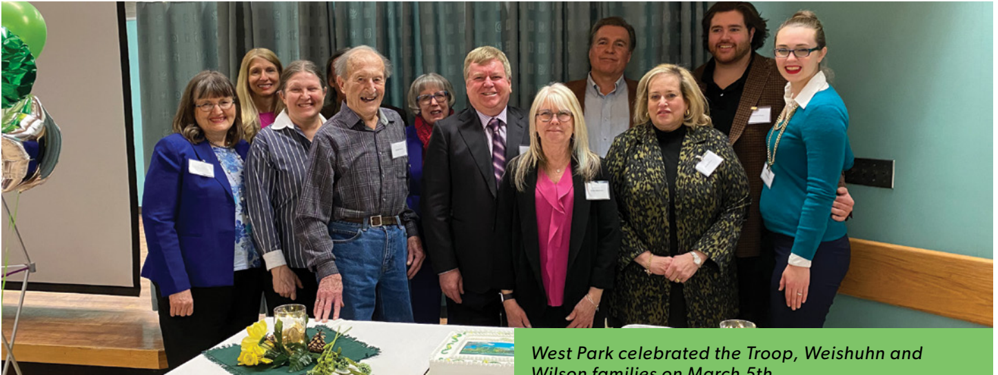
West Park celebrated the Troop, Weishuhn and Wilson families on March 5th.

On March 5th, West Park celebrated the support of three families that have made significant contributions to the Foundation's Get Your Life Back Campaign .